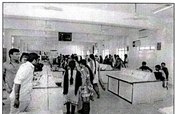
Experts reviewing the projects displayed