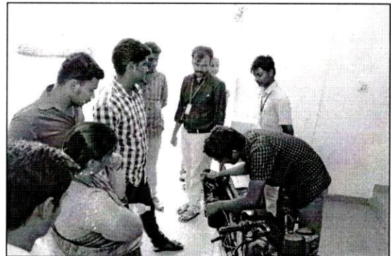
A view of the projects displayed at the Project EXPO