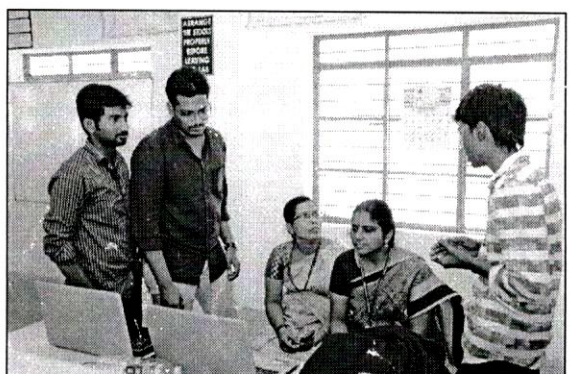
Experts reviewing the projects displayed

Students of various streams of engineering from institutions all over the state came out with 30 working models and exhibited them. A team of experts reviewed the projects based on Innovation/ Novelty, Working model/ Simulation result and Relevance to the field / social needs.